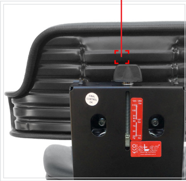
Weight Adjustment Knob