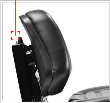
Weight Adjustment Knob